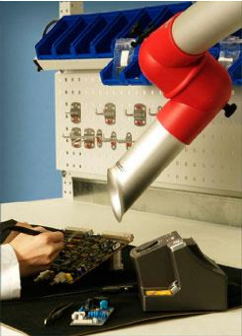
Image 4: Soldering fume extraction at manual workplace – utilization of a suction pipe mounted on an extraction arm

Basically, the appropriate capturing element can deliver a substantial contribution to the quality of the extraction and filtration device. The degree of capture rate forms the basis for subsequent high-grade filtration, finally providing high overall efficiency and low residue in the returned clean air.