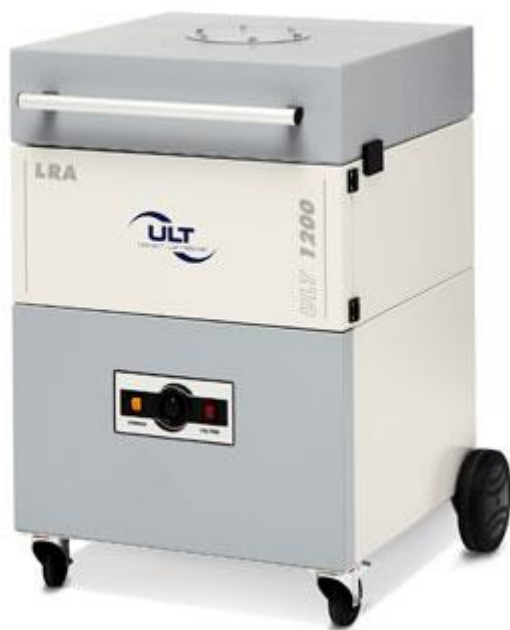
Image 2: Mobile extraction and filtration system for larger amounts of soldering fume, the LRA 1200 from ULT

The early removal of airborne pollutants prevents their impact. Extraction and filtration systems provide an effective solution. The variety of systems on the market is high. Extraction and filtration units are determined by type, composition and amount of pollutants, system utilization in automated, semi-automated and manual production as well as mobility or flexibility.