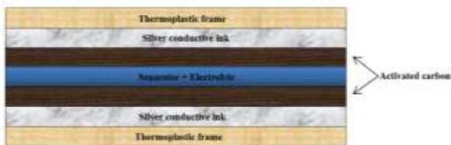
Fig. 1 Schematic of design structure of supercapacitor.

The supercapacitors designed for this study comprise of two electrodes and a separator layer with soaked in electrolyte. Figure 1 shows the schematic of the cross-section of the supercapacitor structure. The 3D frame for the supercapacitor was designed using Solidworks software and created by the 3D printing machine. A view of the frame is shown in Figure 2.