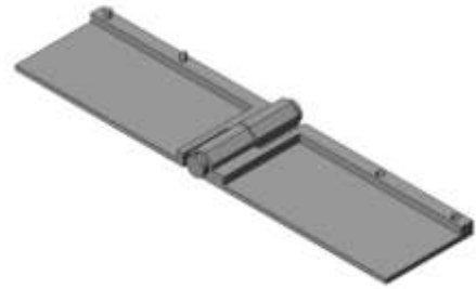
Fig. 2 The 3D frame for the supercapacitor

The 3D frame for the supercapacitor was designed and similar to a hinge with a size of 3 x 5 cm. It can be printed in one printing event and requires no assembly. In addition, this design makes it easy to form the supercapacitor when all layers are finally printed.