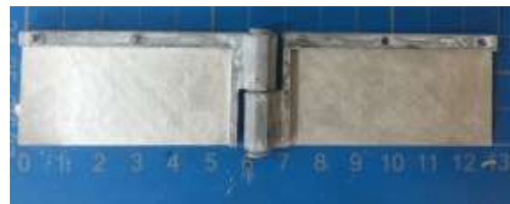
Fig. 3 Paste Extrusion system prints the silver conductive ink on 3D packaging frame structure.

The paste extrusion system was used to print two materials. The 3D packaging frame was printed first with silver conductive paint. The conductive paint was printed three times with a size of 3 x 5.5 cm on each side of the 3D frame objects in order to build the conductive current collector layer. Then the sample was dried at room temperature after each of these layers was printed to enhance the adhesion of the carbon slurry layer to be coated onto it.