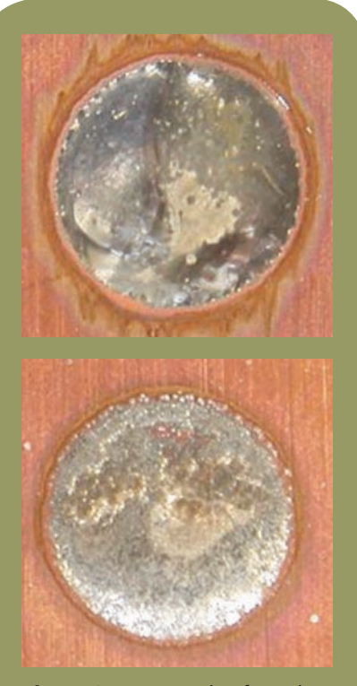
Figure 2. An example of good solder wetting (A) and poor wetting (B).